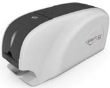
Single sided ID CARD PRINTER smart-31 S