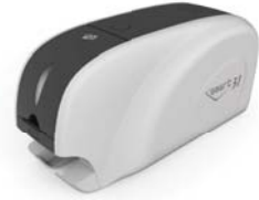
Rewritable ID CARD PRINTER smart-31 R