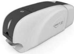
Dual sided ID CARD PRINTER smart-31 D