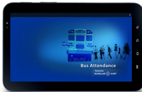
Dash-mounted tablet is viewed by the bus driver who can see student photos as they tap onto the bus

All attendance data is available to the bus driver and school administrators