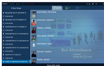
View of students assigned to a bus stop