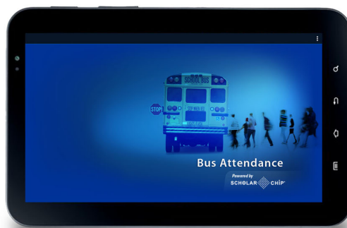
Dash-mounted tablet is viewed by the bus driver who can see student photos as they tap onto the bus

All attendance data is available to the bus driver and school administrators