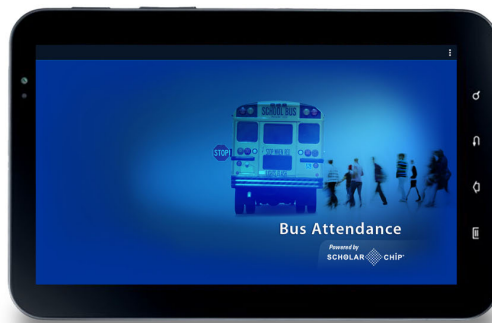
Dash-mounted tablet is viewed by the bus driver who can see student photos as they tap onto the bus

All attendance data is available to the bus driver and school administrators